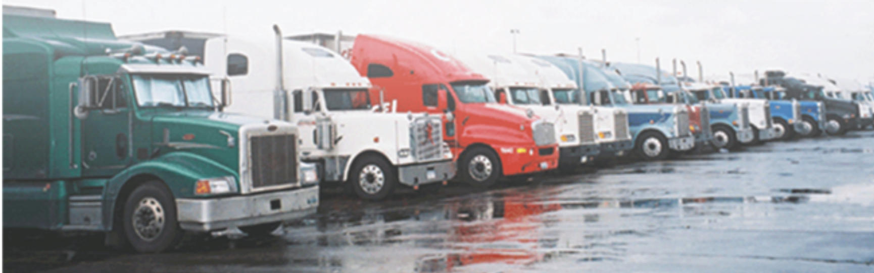
Thursday, August 28, 2014 from 11:00 am

Where: On Site: Newell Highway, MOREE NSW 2400